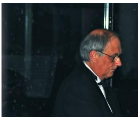
Gala Concert and Dinner performers more Gala photos: www.finlandiadc.org