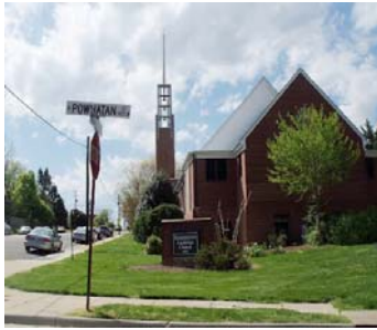
Resurrection Evangelical Lutheran Church, 6201 Washington BLVD, Arlington, VA