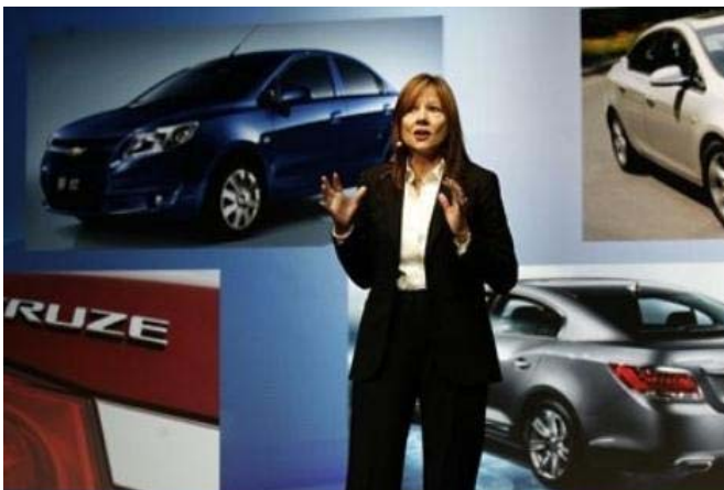
CEO of General Motors, Mary Barra

Mayer became CEO of Yahoo in 2012 and has since been featured in a number of magazines including Vogue, Forbes, and Fortune. As CEO, Mayer has made a number of major acquisitions for Yahoo, including Tumblr, a popular social media platform. In her everyday life, she balances her career with an assortment of active hobbies, including running and dancing.