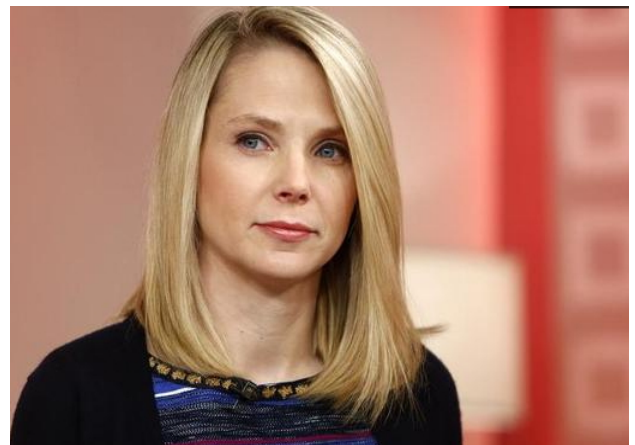
CEO of Yahoo, Marissa Mayer

Source: http://www.forbes.com/profile/mary-barra/