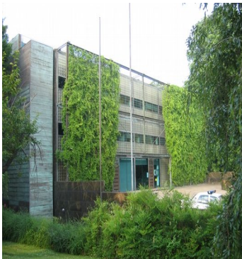
Embassy of Finland 3301 Massachusetts Avenue, NW, Washington, DC