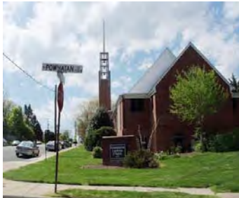
Resurrection Evangelical Lutheran Church 6201 Washington BLVD, Arlington, VA