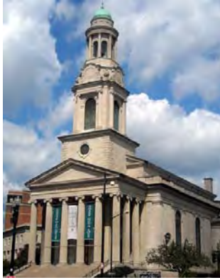
National City Christian Church, Washington, DC