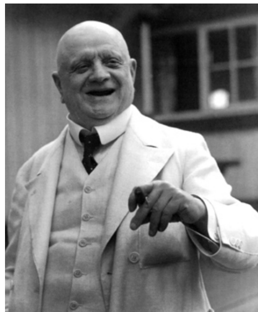
Text: Erika Carlson

For complete information on Sibelius' 150th Anniversary Celebrations written in English, please refer to http://sibelius150.org .