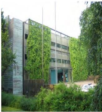
Embassy of Finland 3301 Massachusetts Avenue, NW, Washington, DC